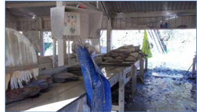
Plate A2/25: Saw benches showing stone to be cut.