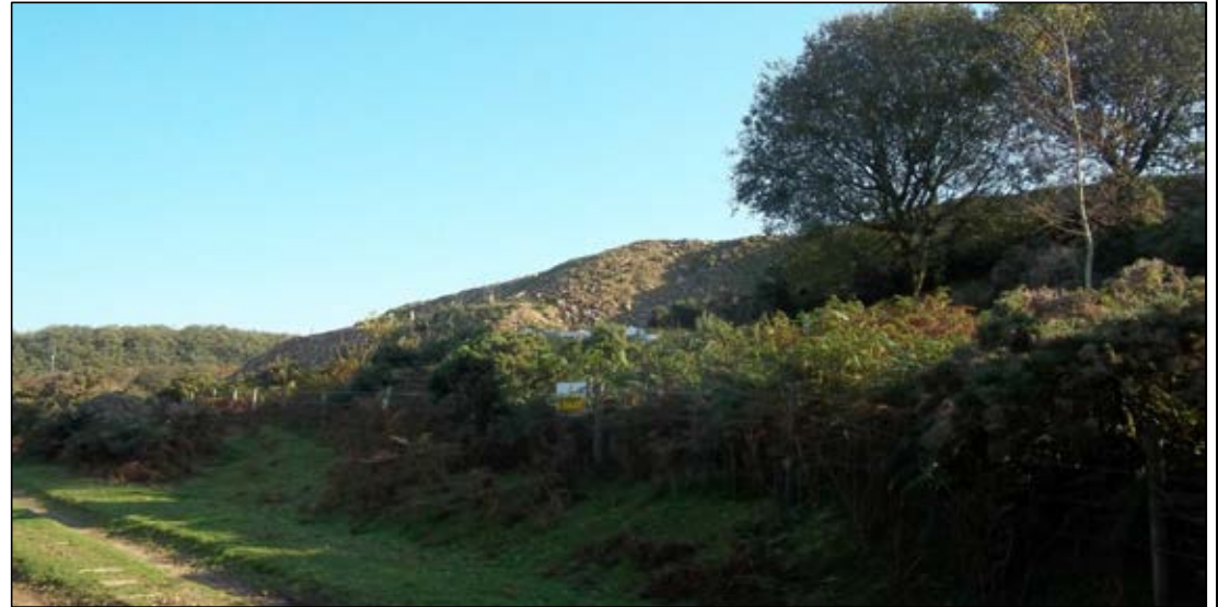
Plate A2/33: View along western boundary showing vegetated bund in foreground; bund to north is partially vegetated (30/09/12).