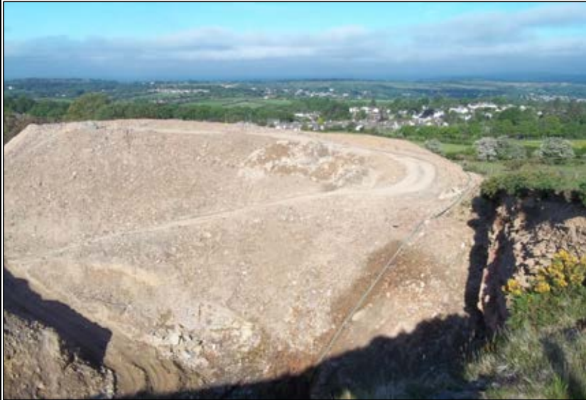
Plate A2/31: Main stockpile against bund along western boundary (29/05/12).