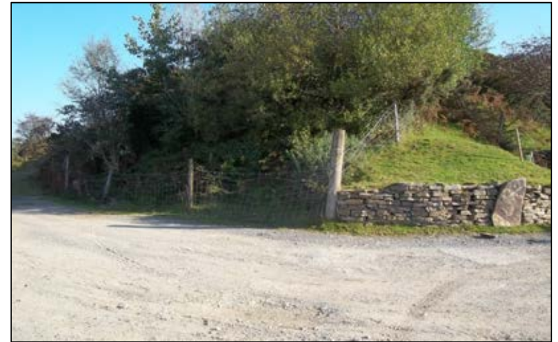
Plate A2/7: View of western quarry edge, showing established vegetation along bund.

Job: PROPOSED EXTENSION TO YENNADON QUARRY, DOUSLAND, DEVON