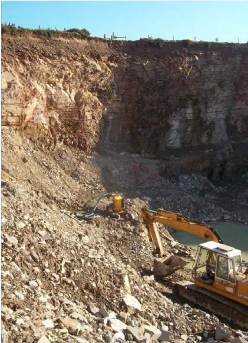
Plate A2/28: View of eastern face (30/09/2011) with extraction currently underway at base of quarry. Excavator fitted with bucket.