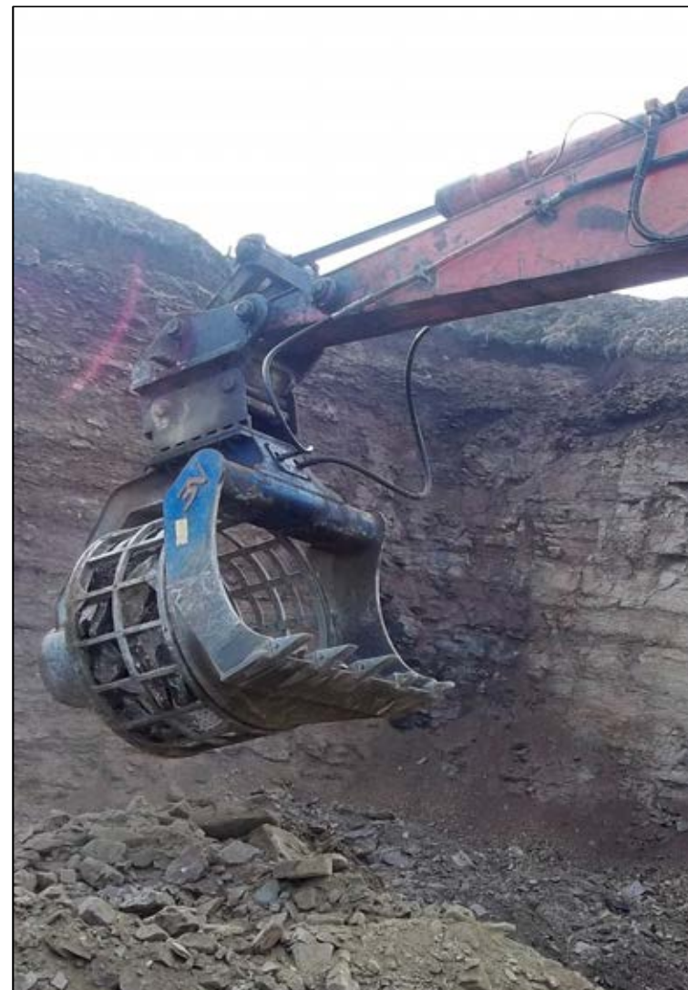
Plate A2/21: Second excavator using a 'pecker' attachment at second working face. Two faces are worked simultaneously to provide efficient operations.