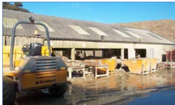
Plate A2/15: Front elevation of saw sheds.