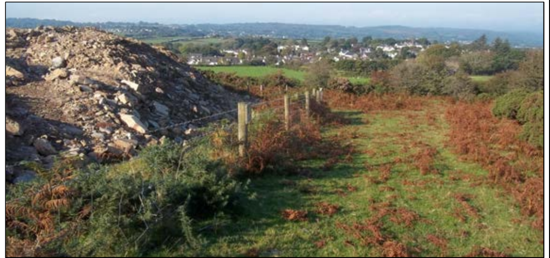
Plate A2/34: View looking west along site's northern boundary (30/09/12).

Job: PROPOSED EXTENSION TO YENNADON QUARRY, DOUSLAND, DEVON