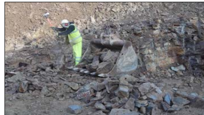
Plate A2/20: Quarry operative hand breaking over-sized stone.

Job: PROPOSED EXTENSION TO YENNADON QUARRY, DOUSLAND, DEVON