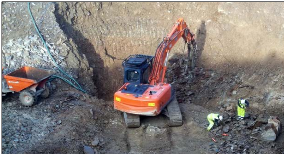
Plate A2/17: Typical working arrangement within the quarry working area - The excavator uses a 'pecker' attachment to break the rock, which is then hand sorted by the two operatives and placed into the bucket. Once full the excavator tips attached the bucket and tips the stone into the dumper truck, which when full is taken to the processing area (10/04/2013).