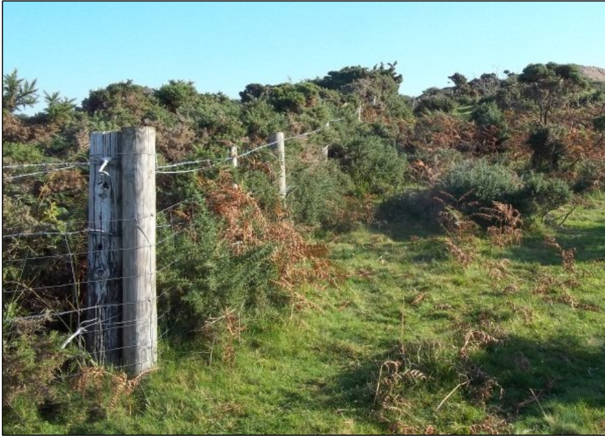
Plate A2/26: View east of site's southern boundary.