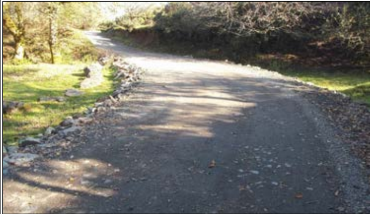
Plate A2/4: Section of access road to Yennadon Quarry.