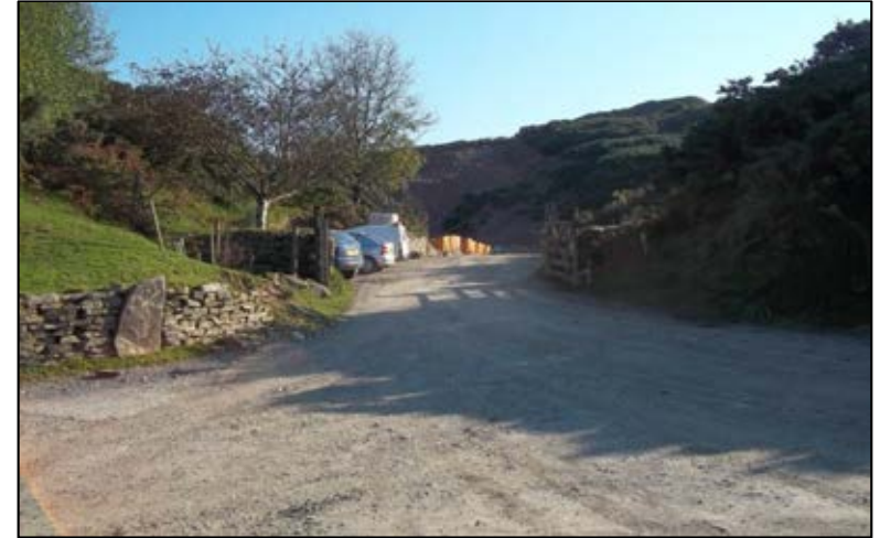
Plate A2/6: Entrance to Yennadon Quarry.