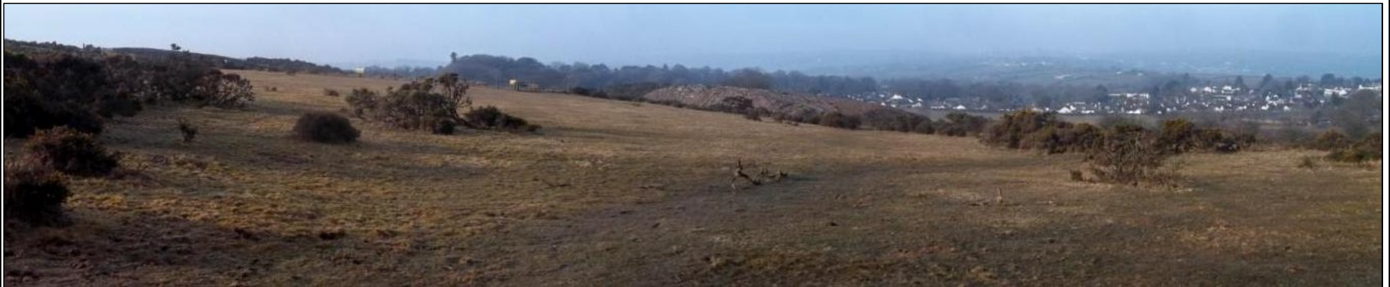
Plate A2/11: Panoramic view north of Yennadon Quarry looking south-southwest. Taken from west of Public footpath (10/04/2013).

Job: PROPOSED EXTENSION TO YENNADON QUARRY, DOUSLAND, DEVON