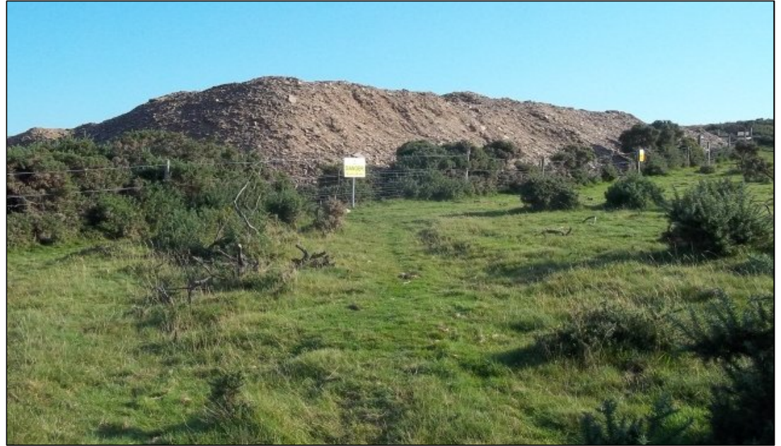
Plate A2/27: View of southern site boundary (30/09/12); this stockpile has since been removed.