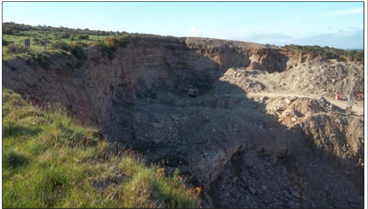
Plate A2/29: View southeast (29/05/12) - current working area.