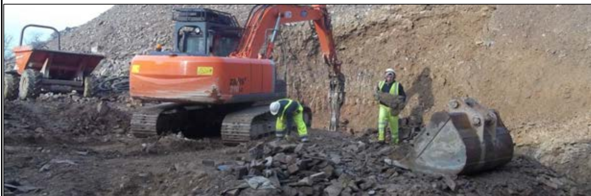
Plate A2/19: Quarry operatives hand sorting stone prior to placing it into bucket.