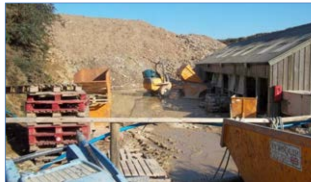
Plate A2/16: Rear of saw sheds.

Job: PROPOSED EXTENSION TO YENNADON QUARRY, DOUSLAND, DEVON