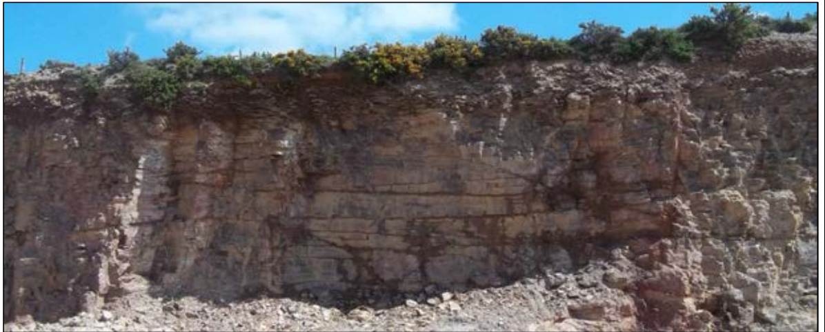
Plate A2/30: High level face being worked in south-east corner (29/05/12).

Job: PROPOSED EXTENSION TO YENNADON QUARRY, DOUSLAND, DEVON