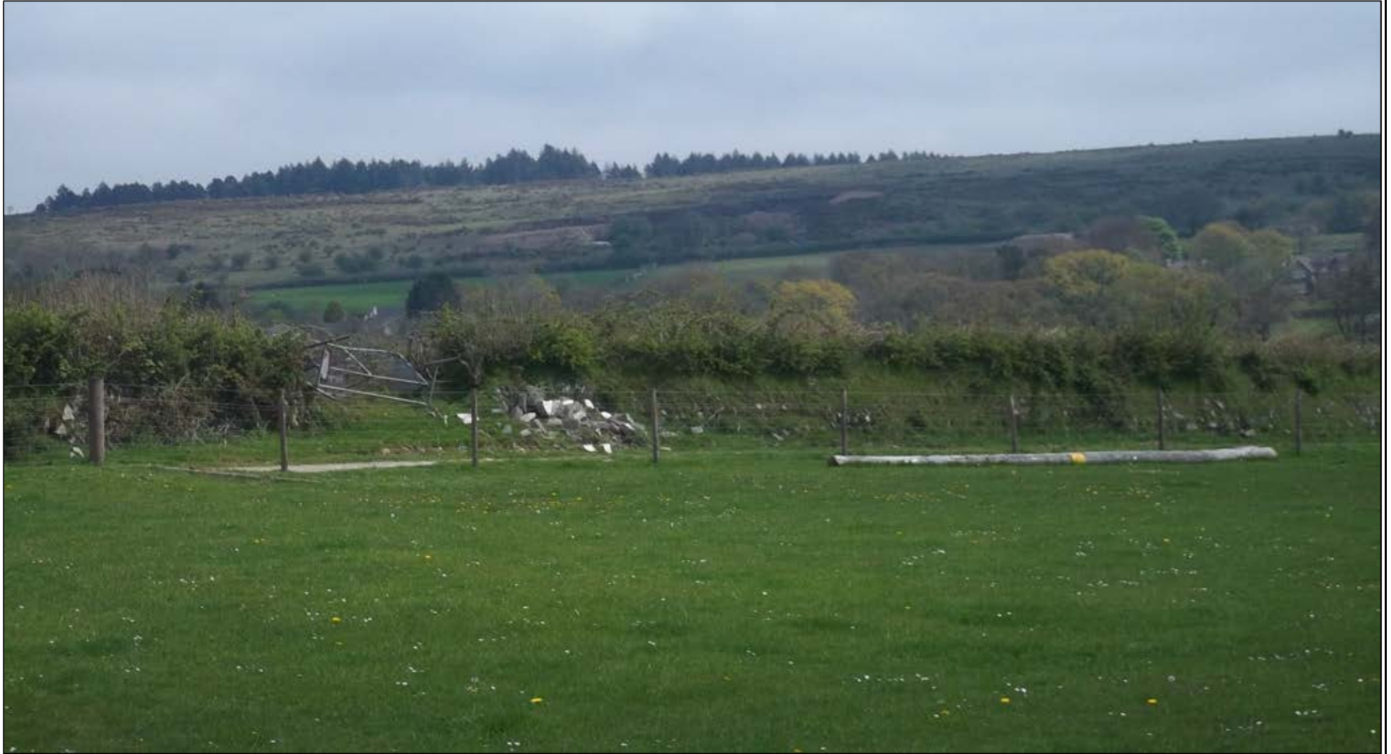
Plate A2/2: View from B3212 (Industrial Units) looking east-northeast towards Yennadon Quarry (04/05/2012).

Job: PROPOSED EXTENSION TO YENNADON QUARRY, DOUSLAND, DEVON