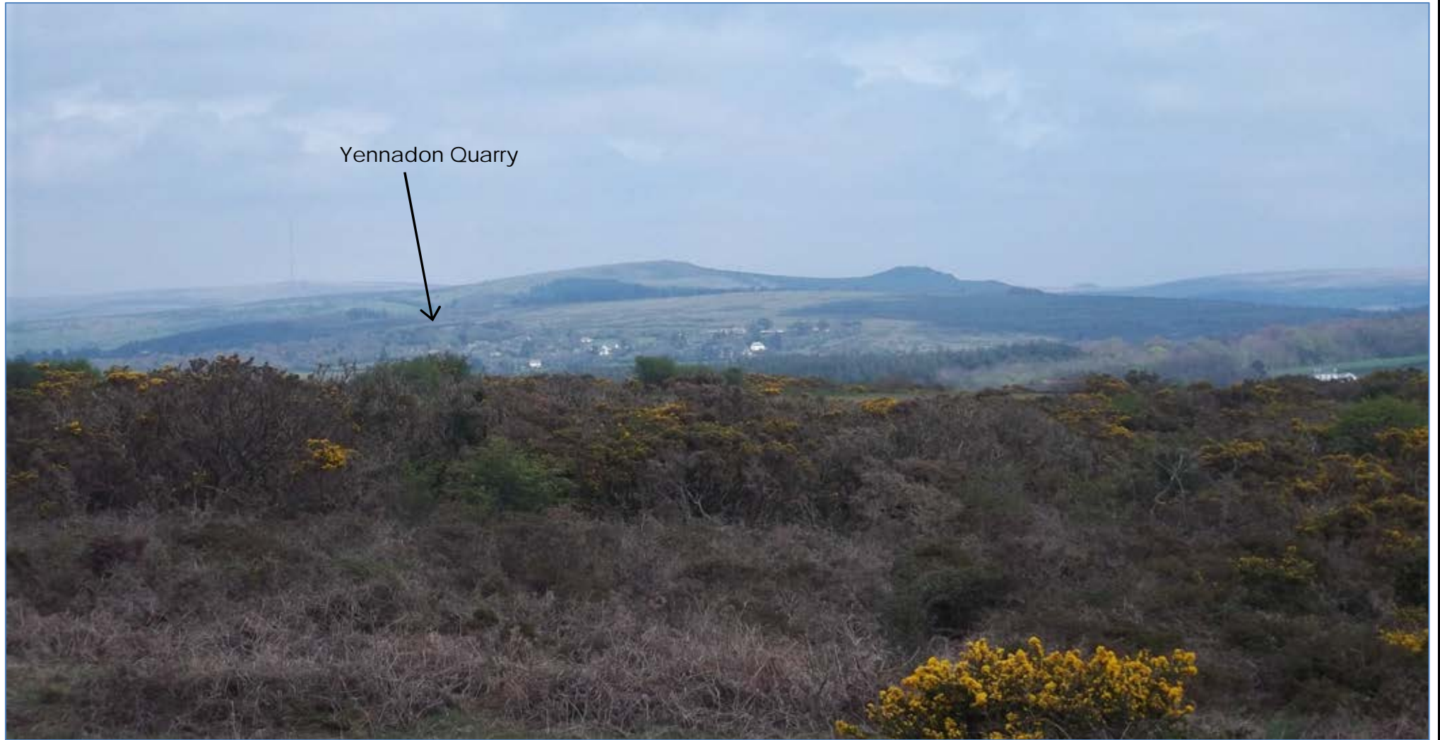
Plate A2/1: View from A386 Roborough Down looking northeast towards Dousland village and Yennadon Down (04/05/2012).

Job: PROPOSED EXTENSION TO YENNADON QUARRY, DOUSLAND, DEVON