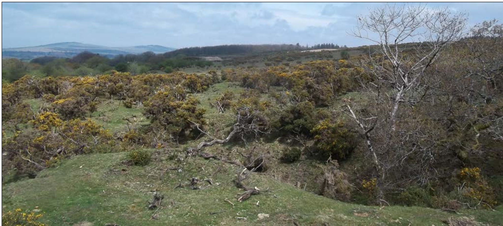
Plate A2/8: View on Yennadon Down east of Iron Mine Lane taken from the remains of "Yennadon Iron Mine" (surface pits associated with 1800s mine) looking north towards Yennadon Quarry (04/05/2012).