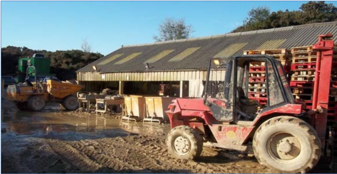
Plate A2/23: View south across Processing Area, showing Forklift in foreground and one of the dumper trucks.