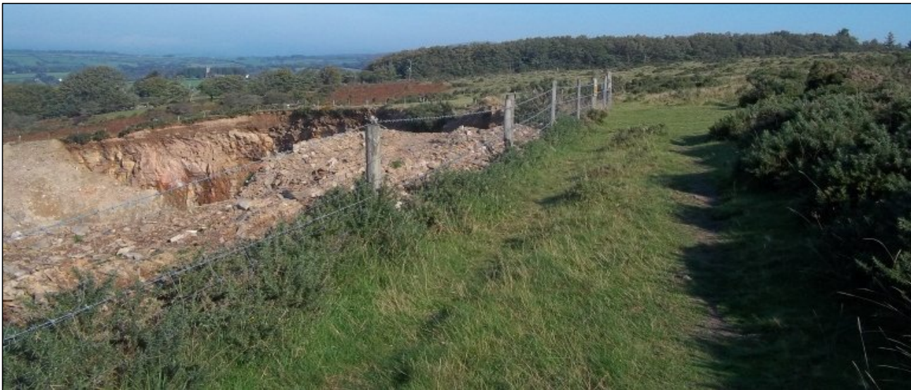
Plate A2/28: View along site's eastern boundary.

Job: PROPOSED EXTENSION TO YENNADON QUARRY, DOUSLAND, DEVON Client: YENNADON STONE LTD