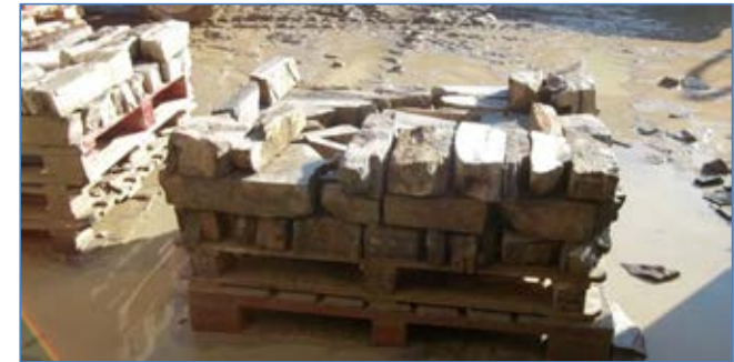
Plate A2/26: Cut stone loaded by hand onto pallets.