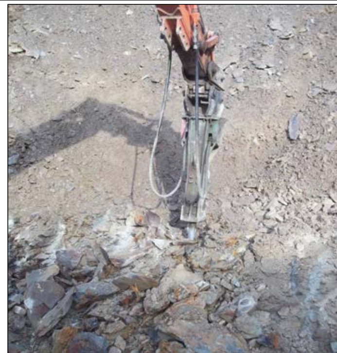
Plate A2/18: Close-up of the pecker attachment, used to break out the rock.