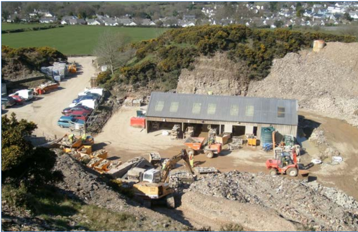
Plate A2/12: Overview of site in 2008; showing processing area and site office compound area. Note staff parking is now moved closer to site entrance (see Plate A2/3).