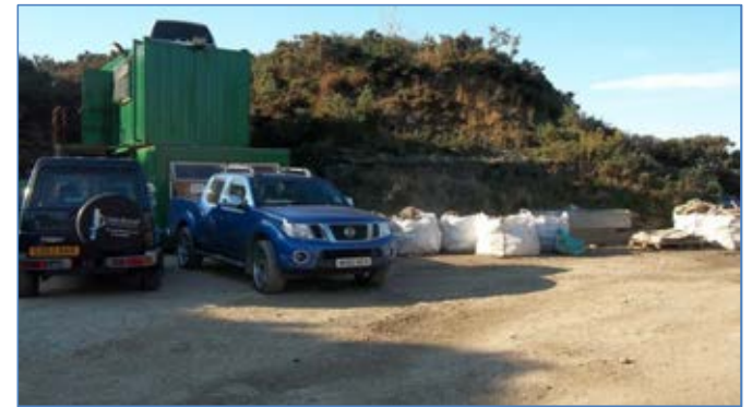
Plate A2/13: Site offices and compound in 2011.