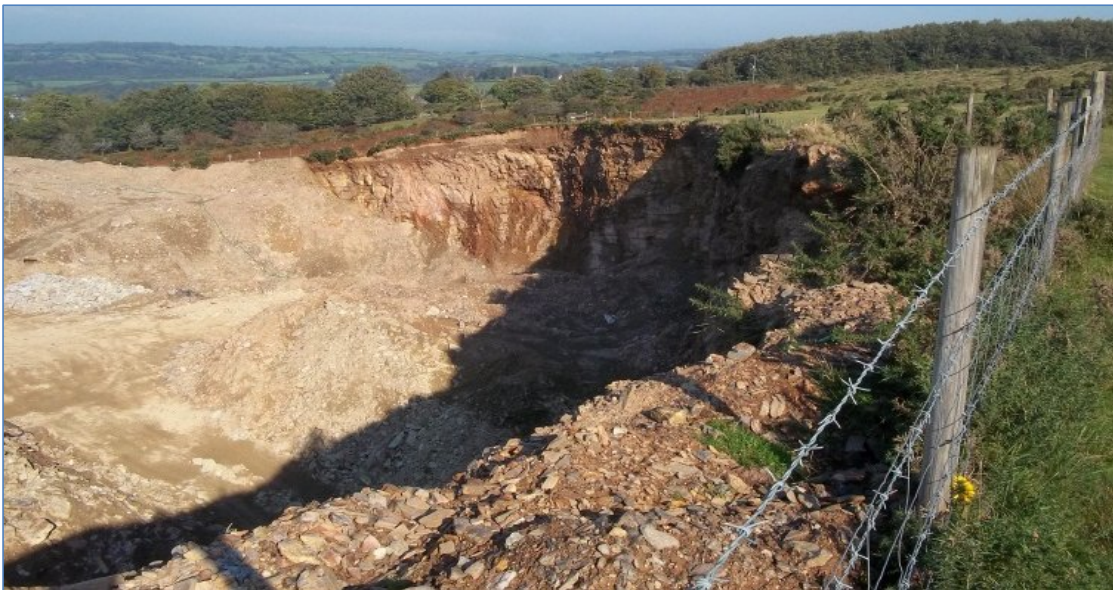
Plate A2/24: View over northern end of quarry (30/09/2011).