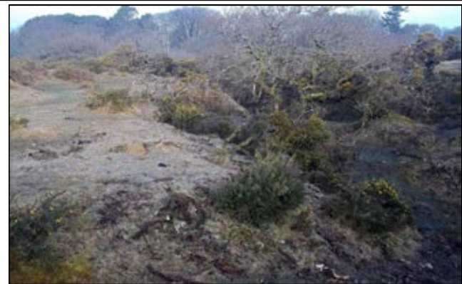
Plata A2/9: View west along the historic surface mine workings / pits of "Yennadon Iron Mine" (10/04/2013).

Job: PROPOSED EXTENSION TO YENNADON QUARRY, DOUSLAND, DEVON