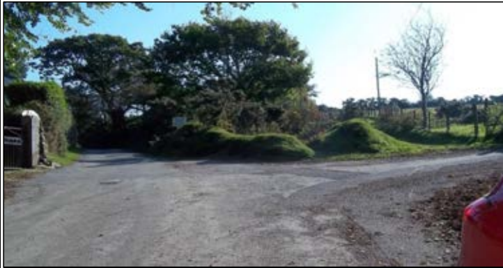
Plate A2/3: East-end of Iron Mine Lane, with access road to Yennadon Quarry on left, footpath to Yennadon Down (centre) and private access road to right.