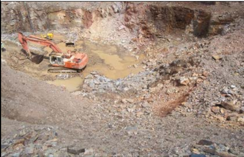
Plate A2/32: Base of quarry (29/05/12).