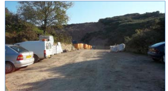
Plate A2/14: Current site entrance, with staff and visitor parking area on either side.