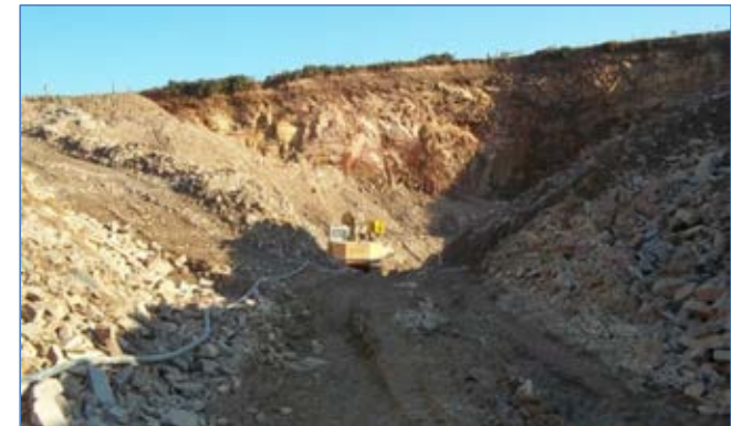
Plate A2/27: View from processing area towards extraction area (30/09/2011).

Job: PROPOSED EXTENSION TO YENNADON QUARRY, DOUSLAND, DEVON